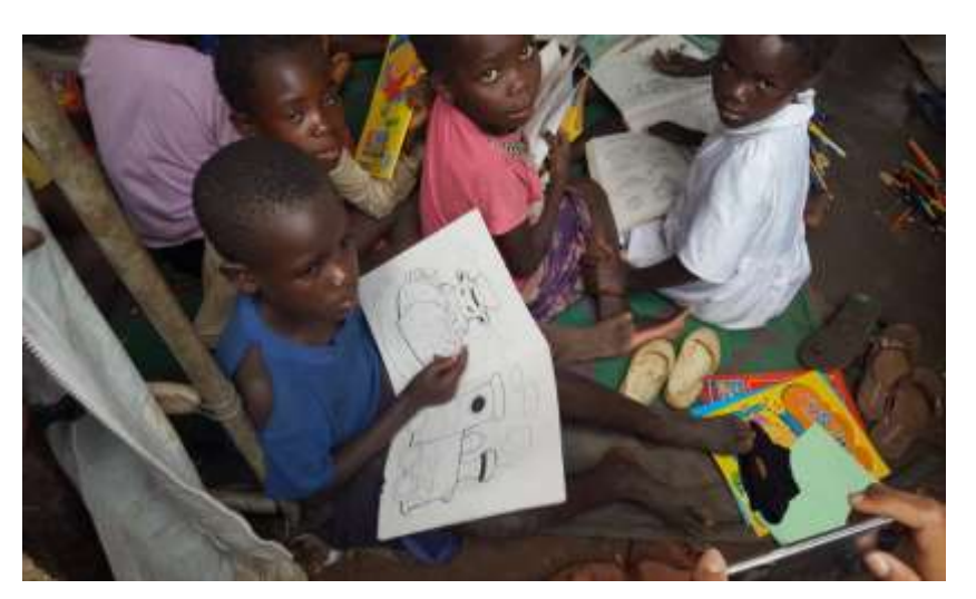
Children learning at a Child Friendly Centre in Kenani Transit Centre